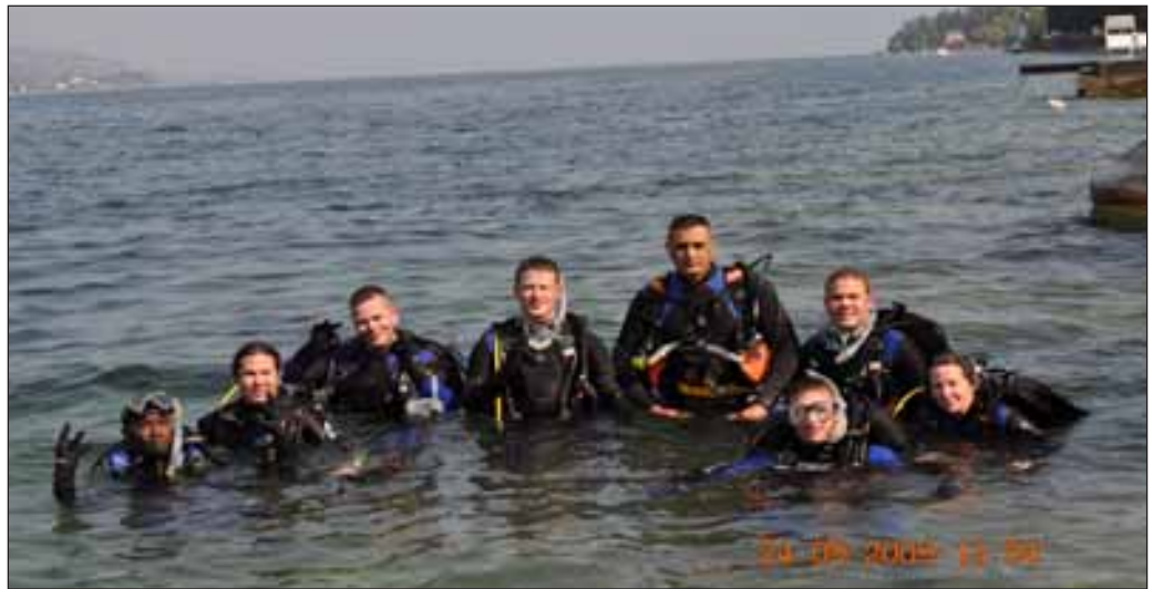
Personnel and community members from Caserma Ederle enjoy high adventure at Lake Garda during a Warrior Transition Unit outing last month.

Training included practicing basic scuba and skin diving skills as well as rescue,