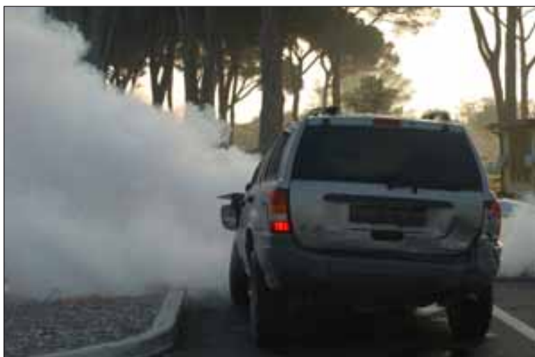
A simulated terrorist attack started off the annual Camp Darby force protection exercise.

Italian Base Commander Col. Raffaele Iubini said "in case of a real terrorist attack, the Italian civil defense is responsible for force protection inside the base and it is imperative that the local emergency responders get familiar with the place as well as the people they are going to deal with."