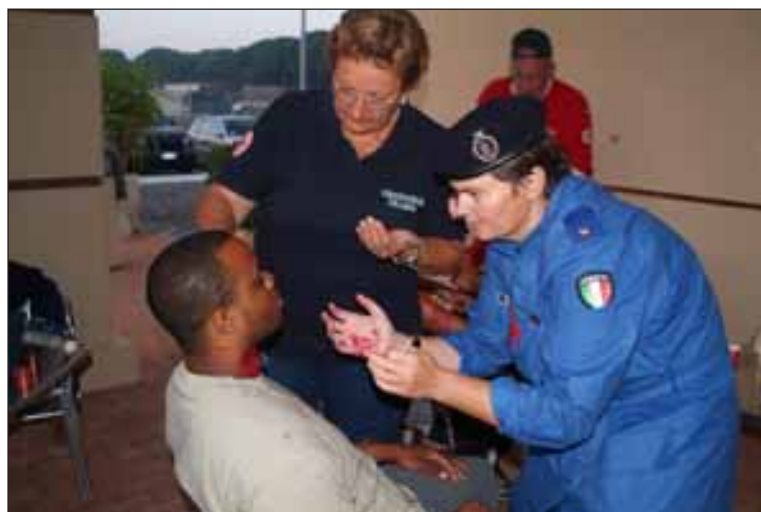
Italian Red Cross employees put makeup on a role player prior to Tuscan Sun Oct. 7.